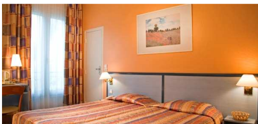
Timhotel Place d'Italie – Butte aux Cailles (217 m) 22 rue Barrault – 75013 Paris3