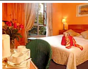
Best Western De Weha (1,1 km) 205 avenue de Choisy – 75013 Paris