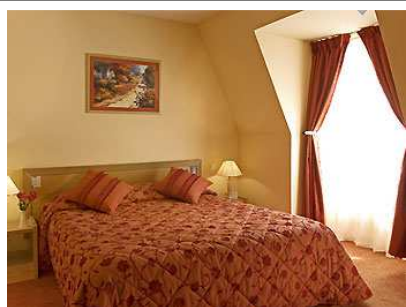
Mercure Paris Place d'Italie (730 m) 25 boulevard Auguste Blanqui 75013 Paris