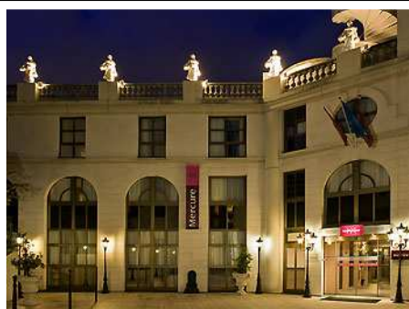
Mercure Paris Gobelins Place d'Italie (1 km) 8bis avenue de la Sœur Rosalie – 75013 Paris