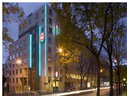
Ibis Italie Tolbiac (484 m) 177 rue de Tolbiac – 75013 Paris